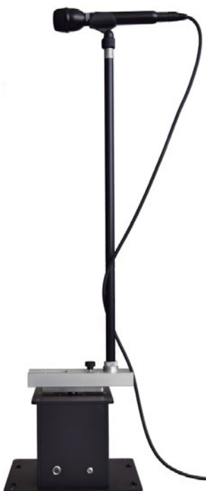
Example of TT01 setup (mic. and cable are not included in package)

The Turntable TT01 offers a remote controlled rotating platform that allows to execute polar plot measurements of microphones or lightweight loudspeakers etc. It includes a step motor with relative position surveillance and an adjustable slide for the exact positioning of the device under test (DUT) over the rotation axis.