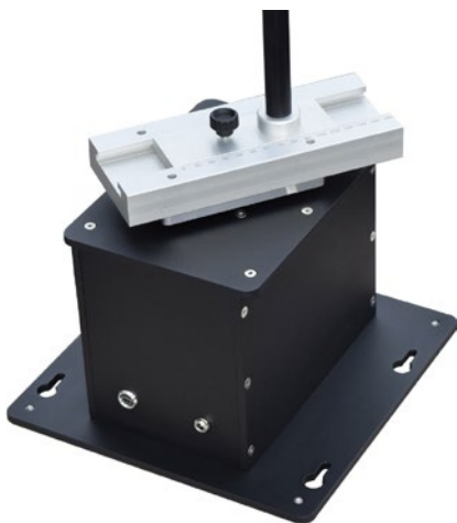
TT01 with slide

The Turntable TT01 allows you to execute directivity measurements (polar plots) of microphones, lightweight loudspeakers or other devices with the FX100 Audio Analyzer. The USB controlled TT01 is supported by the RT-MicFX and the FX Loudspeaker Directivity software, and can also be programmed to your individual needs, using a .NET API or MATLAB library.